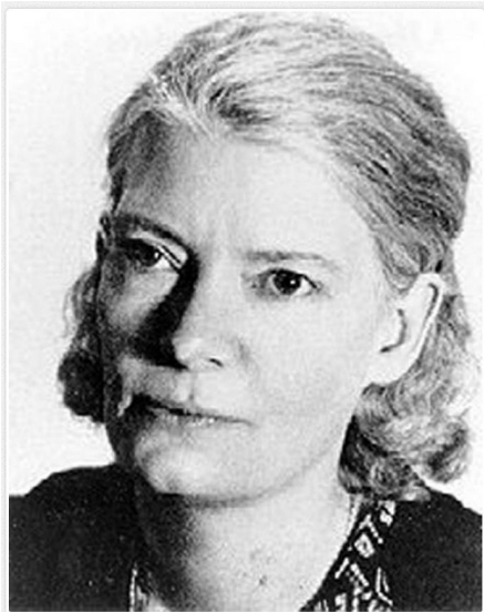
Dorothy Day founded the Catholic Worker with Peter Maurin. Day created houses of hospitality for poor and homeless people and acted in nonviolent resistance to war and injustice.