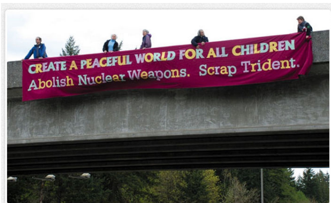
Trident protesters on a freeway overpass: "Create A Peaceful World For All Children. Abolish Nuclear Weapons. Scrap Trident."

The same activists that were pushing nonviolence to its outer limits by staging increasingly radical confrontations with the U.S. military, were also highly committed to recognizing the humanity of the naval base workers, both civilian and military. They spent hundreds of hours trying to create a dialogue with Trident base personnel and refused to see them as the enemies of peace.