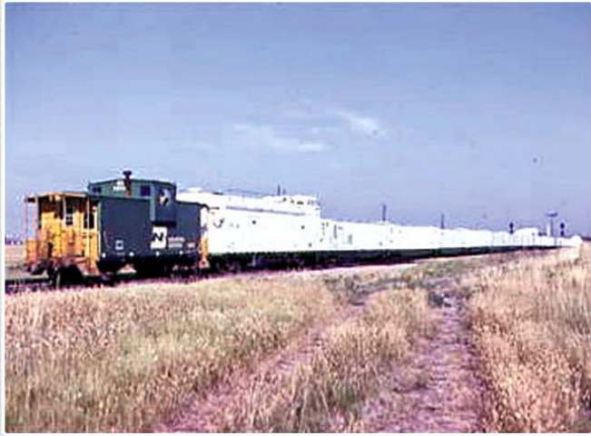
The White Train was loaded with nuclear warheads and had gun slits in the heavily armored cars. One newspaper called it the "Armageddon Express."

A reporter warned Jim Douglass that he had observed a train north of Seattle that looked like it was "carrying big-time weapons." The reporter added that the heavily armored, all-white train looked like "the train out of hell."