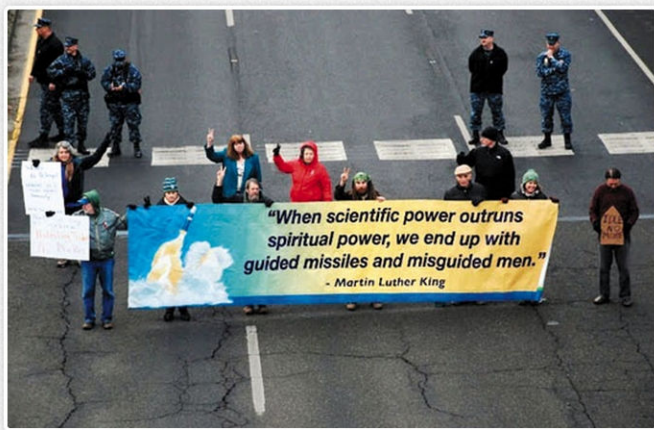
"When scientific power outruns spiritual power, we end up with guided missiles and misguided men." — Martin Luther King.