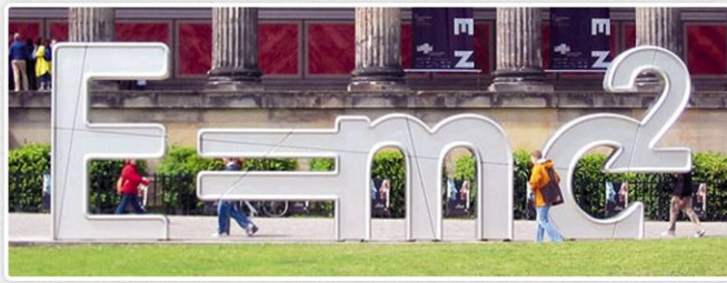
Einstein's formula changed the world by showing the conversion of mass to energy. Sculpture of Einstein's formula in Berlin, Germany.