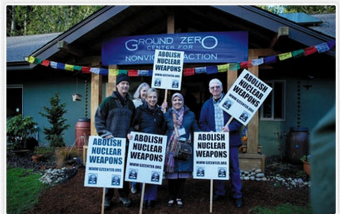
Ground Zero Center for Nonviolent Action still continues to be very active in working for the abolition of nuclear weapons.