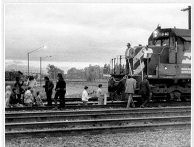
Many anti-nuclear activists in hundreds of towns around the nation held vigils or were arrested for blocking the White Train.

Spirit: It all began with only a handful of activists and train buffs. How did it feel when it blossomed so quickly into a campaign that involved hundreds of communities all up and down the tracks?