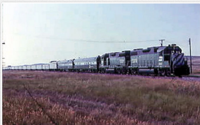
The White Train transported nuclear weapons to military bases across the nation.

The Street Spirit interview with Jim Douglass, Part 3: Strangely enough, acts of resistance to the White Train's deadly cargo of terribly destructive nuclear weapons created a community dedicated to peace all along the route of a Holocaust train.