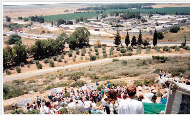
Members of the Walk for a Peaceful Future demonstrate on June 6, 1992, on Mount Carmel, above Atlit Military Prison in support of Israeli soldiers imprisoned for refusing to serve in the Occupied Territories.

They said, "We do not want to pay for the weapons that kill our children." So they stopped paying taxes. I looked at that picture of these radiantly smiling women, and I thought, "What a story, coming right out of the context of where Jesus was."