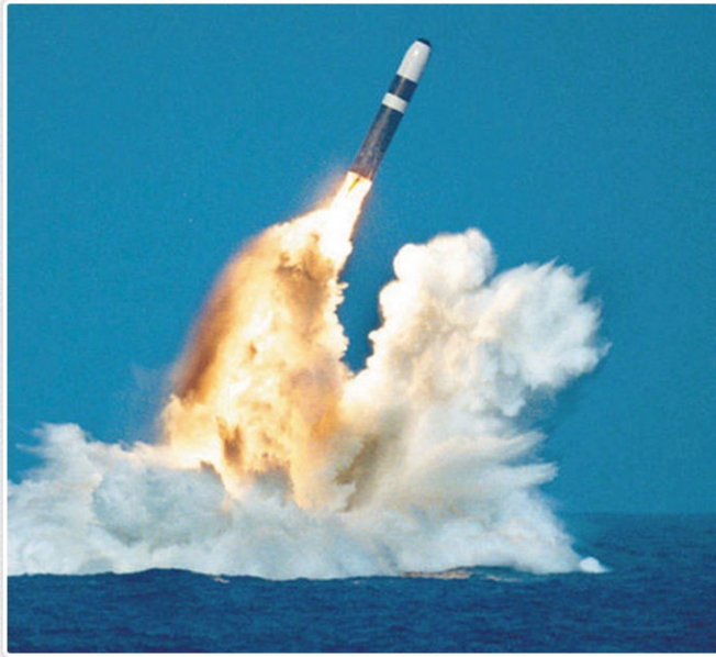
A missile is fired from a Trident submarine. Lockheed missile designer Robert Aldridge determined that the accuracy, short flight time and explosive power of Trident missiles give the Trident submarine a first-strike capability.

Spirit: I understand that first-strike weapons of mass destruction are war crimes under Nuremberg principles. But why did Aldridge conclude that Trident was a first-strike weapon?