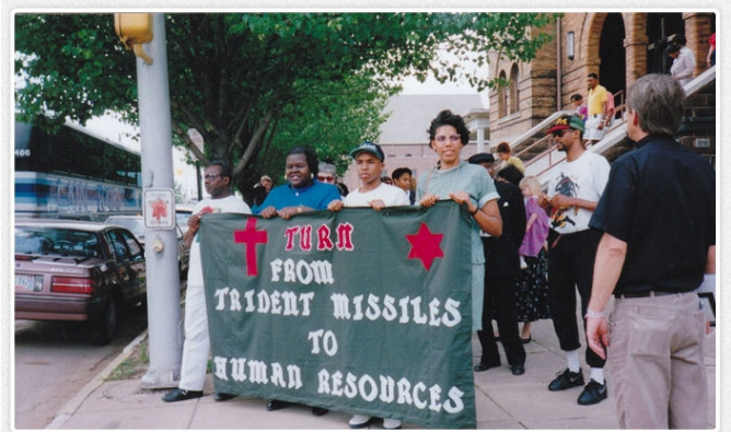
On Good Friday/Passover, people walk for peace and disarmament from the 16th St. Baptist Church in Birmingham, Alabama, a church that played a vital role in the civil rights movement, to the Trident train tracks on April 17, 1992.

the way to respond to the awful question of nuclear war. I believed deeply that Jesus and the Catholic Worker, in our own context, and those other people who believed in nonviolence, were living out the answer.