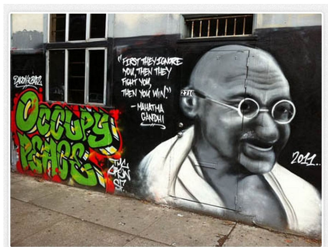
During the Occupy movement, this beautiful image and quote of Gandhi was painted on a wall in San Francisco.

The Street Spirit Interview with Jim Douglass, Part 4: "We chose to be in the sights of the weapons of our own troops. For a few days, we were just as vulnerable as the Iraqi people. Explosions were occurring all over the city from missile attacks by our fleet in the Gulf."