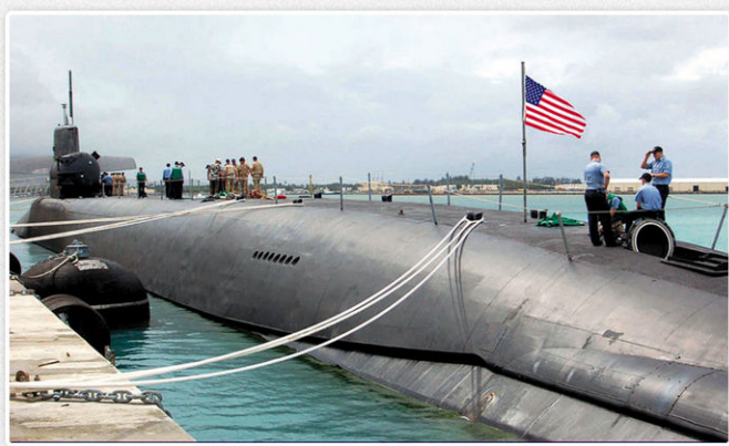
The USS Ohio was the first Trident Ballistic Missile Submarine in 1982. Shown above in 2008, it became the first Trident to undergo a billion-dollar conversion into a guided missile submarine able to launch 154 Tomahawk cruise missiles.

One Trident submarine can destroy a country. A fleet of Trident submarines is capable of destroying the world. Jim Douglass explains how Ground Zero Center organized a visionary campaign of nonviolent resistance to confront "the Auschwitz of Puget Sound."