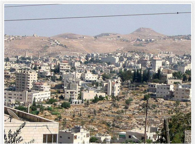
Beit Sahour, the traditional site of the shepherds' field in Luke's Gospel, is a Palestinian town that became an example to people across the globe of the refusal to cooperate with their own oppression.