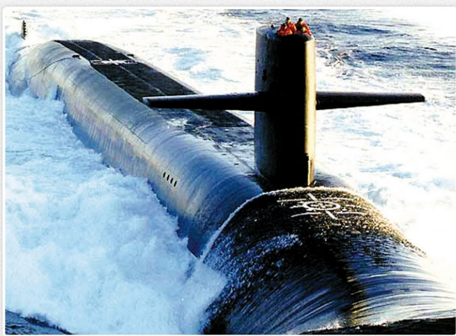
The USS Ohio (shown above) was the first in a fleet of Trident submarines. A single Trident sub has the explosive power of several thousand Hiroshima bombs and could destroy every city in an entire nation.

A former Air Force sergeant testified that while he was stationed at Hickam Air Base in Hawaii, he had witnessed “the deliberate targeting of a Laotian hospital for obliteration bombing, as well as the targeting of numerous other civilian objectives.”